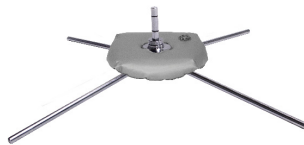
X-Base w/ optional water bag