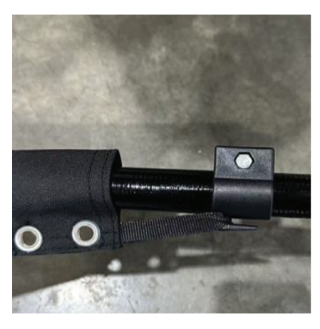
4. Tether bottom of flag trim pockets to tether point on flag pole to complete graphic installation. Slide flagpoles onto mounting posts of spike or x-bas to finish archway set up