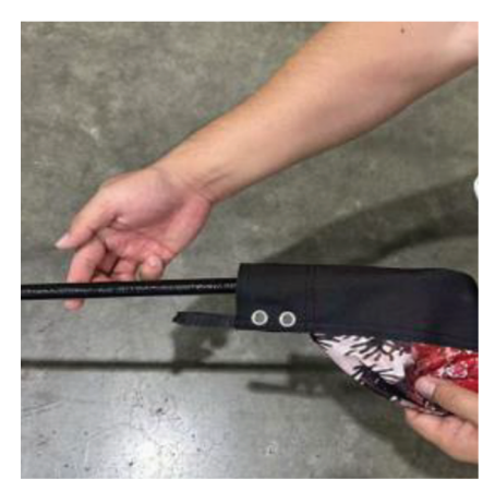
2. Slide mid pole into pocke trim of flag. Once mid pole is fully inserted, make sure both ends of the pole are exposed.