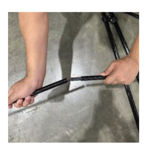
1. Assemble mid pole set by inserting one end of each pole into the other. Poles are bungeed together for easy assembly.