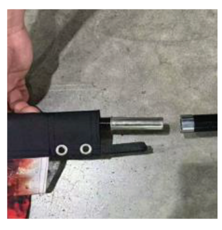
3. Insert base poles into both ends of the mid pole to complete pole assembly.